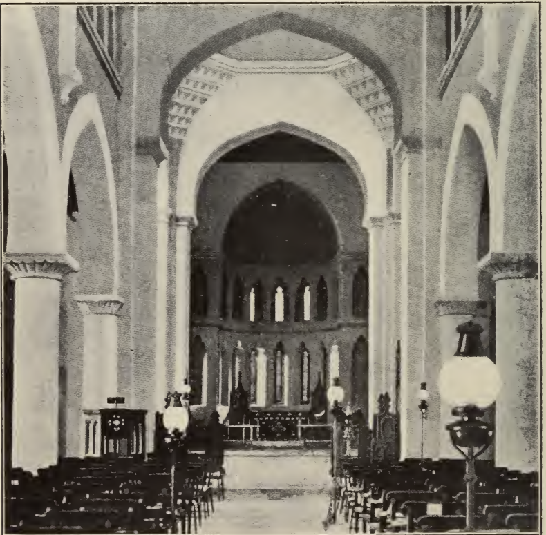
MOMBASA CATHEDRAL, BRITISH EAST AFRICA